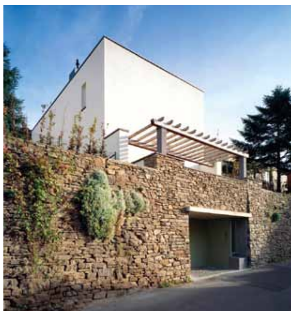
Picture 32 - new building in Koblenz (DE) modern architecture integrated in landscape

Modern buildings should reflect contemporary design principles, and not deny their period of existence. Nevertheless, new constructions or additions should deal with the existing building situation and react accordingly. The architectural design of new constructions can, on the one hand, be oriented towards the surrounding area with regard to the colours, materials and shape or, on the other hand, a completely contemporary architectural language can be used, finding its expressions also in shape, material and partly in colour. In the latter case anyway, the building tradition (height, colour, etc.) should be respected.