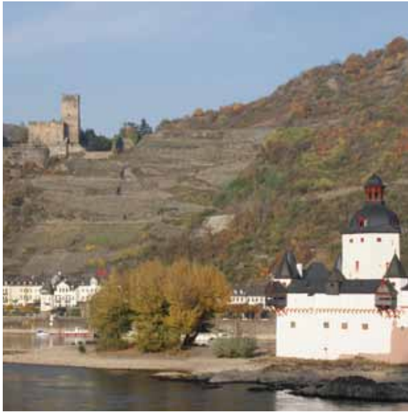
Picture 57 - Renewed cultivation of the abandoned vineyards at Kaub (Fortified castle of Gutenfels)