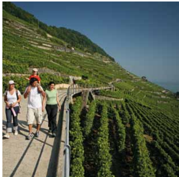
Picture 45 - The roads, facilitating the activity of the winegrowers, Lavaux (CH)

The purpose of these paths is to facilitate the exploitation of the area. The reorganisation of the plots aims to reduce the fragmentation of the land by merging the plots belonging to the same owner, in order to facilitate the activity. This operation, combined with the work linked to rural engineering, requires the establishment of a syndicate involving all owners of a given