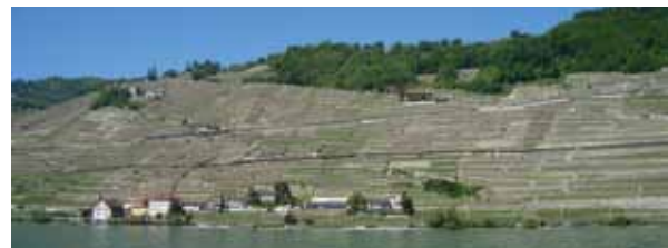
Picture 25 - The monocultural "wall" of the vineyards of Lavaux (CH): natural dynamics and settlement rules decrease the risk of landscape trivialization

much more a multifunctional producer of positive environmental externalities as farmers begin to understand the importance of organic farming and direct selling of their products as well as providing hospitality to visitors. All these ongoing dynamics could help to avoid risks of landscape trivialisation or desertification.