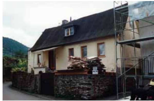
Picture 28 - Residential building of Family Müller in Oberwesel (DE) before renovation

To strengthen the dwindling settlements and in particular the village centres, an expansion of development areas should be avoided. To prevent increasing land and landscape consumption by new construction areas, settlement development should be focused on internal development. Measures to strengthen and enhance town and village centres may be the conversion of buildings, technical and financial incentives, the reorganisation or mere restoration of public spaces or different planning tools. These measures should be adequately framed by a creative planning process. The set of options for conversion of now void and functionless buildings is wide. The conversion of former agricultural buildings into private buildings (housing, private business etc.) or communally used buildings (village hall, museum, multigenerational houses, club houses etc.) and vice versa is conceivable. But, at least the characteristics of the former function, as well as the main features of the building should remain visible.