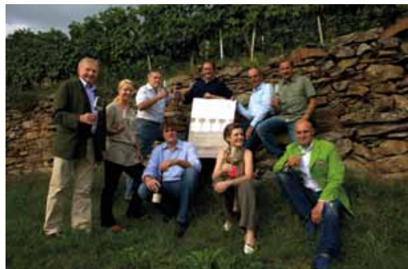
Picture 48 - In 1983, 24 winegrowers from the Wachau vineyards mobilised to protect their vineyard landscapes. There are over 200 of them today

This dilemma between protection and adaptation to development is crucial for these vineyard landscapes, whose conservation is directly linked to their economic profitability. The investment made by winegrowing professionals such as the vintners' association, Vinea Wachau Nobilis Districtus, or by winegrowing unions (Val d'Orcia, Lavaux, Val de Loire, Alto Douro) are a reminder of their determining role in preserving the landscape identity of these sites.