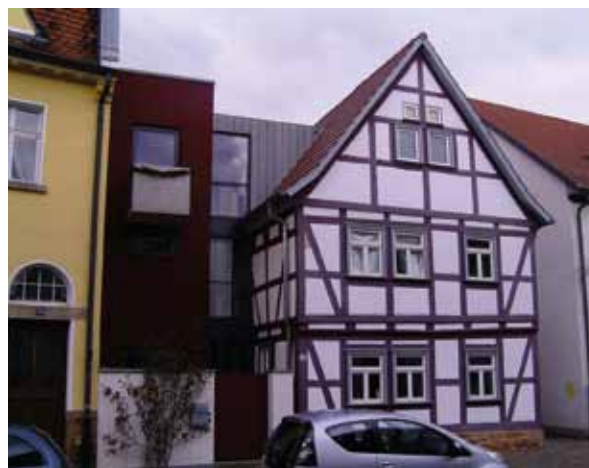
Picture 33 - Integration of modern additions in traditional building stock in Fulda (DE)