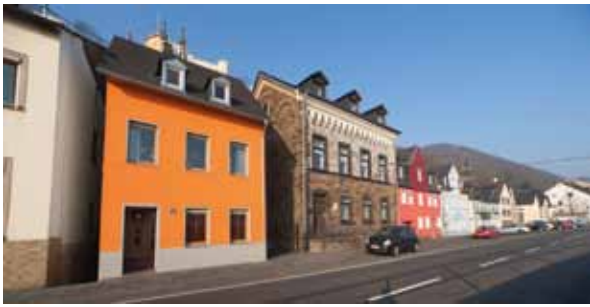
Picture 34 - unadapted colours disturb the harmony of the street near Koblenz (DE)