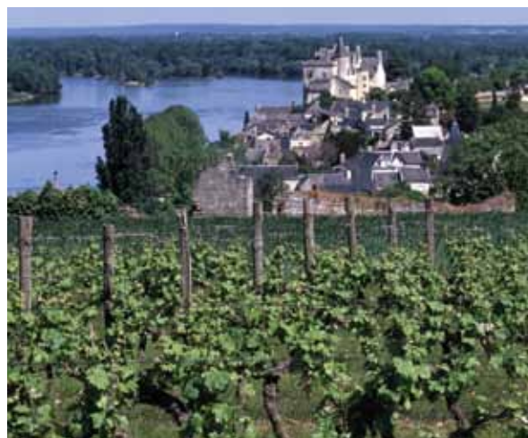
Picture 54 - the Val de Loire cultural landscape : a fusion between nature and culture, heritage river fronts and large vineyards areas over the hills of the river

This added value, conferred by taking into account cultural landscapes, requires networking among all the public and private decision-makers, as well as the involvement of the inhabitants and stakeholders. The Management Plan provides overall guidelines that couple commercial interests – and those of winegrowers in particular (merchants and producers) – with the objectives of safeguarding the cultural, environmental and landscape values of a territory, all goals defended by the inhabitants.