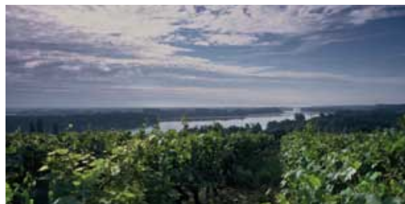
Picture 53 - La Coulee de Serrant: one of the famous expressions of the cultural landscape of Val de Loire

safeguarding it from urban sprawl or 'scattering', from agricultural abandonment and, above all, promoting environmentally-friendly cultivation practices as the guarantee of quality production. The ecological management of land, the architectural quality of buildings, and taking the landscape qualities of the terroirs into account have all become economic arguments used to defend a European winegrowing sector that is increasingly confronted by fierce competition from the winegrowing industry in the New World.