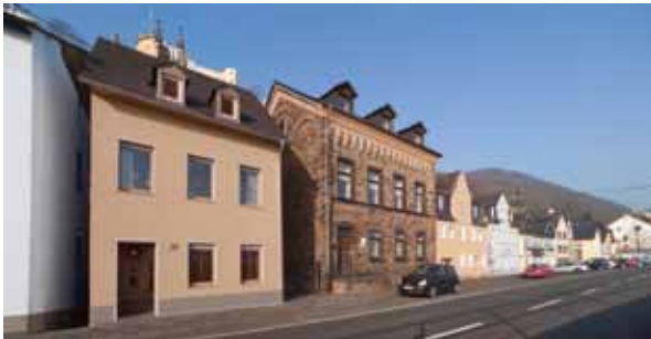
Picture 35 - In terms of colour less is oftentimes more (computer animation)

The overall impression of a building and its surroundings is not determined only by its structure, building material and colour. There are a lot of other elements, smaller and bigger ones, which contribute to the visual harmony of the whole.