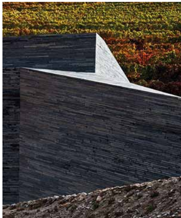
Picture 38 - natural material and modern shape are in harmony with landscape. Quinta do Vallado in Douro Valley (PT)

In many places, it is very important to find new roles for many old buildings, as well as to renovate them and give them imaginative forms of reuse. The Douro Architecture Prize was established in 2006, during the celebration of 250 years of the Douro Demarcated Wine Region, and is to be awarded every two years. Its subject is contemporary architecture, recently built in the Region, and aims to recognise outstanding examples built, effectively contributing to improving the constructive panorama of the Alto Douro region, so as to make architecture one of the most important components of excellence in the Douro cultural landscape. The objectives of the prize are to distinguish architecture work done since 2001 (when the Douro was inscribed in the UNESCO World Heritage list) as well as to improve contemporary architectural languages regarding heritage values, good integration of modern materials, the recovery of traditional forms of construction, renewal of public spaces, encouraging private owners to renovate their degraded façades and buildings. Finally, the aim is to promote, through qualified architecture, the Alto Douro as a tourist region and a cultural landscape that knows how to care for its heritage values.