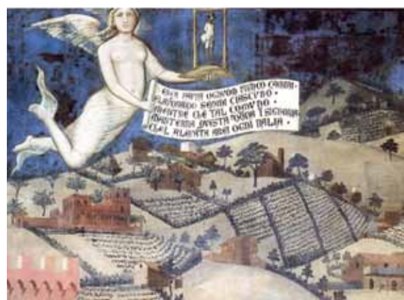
Picture 47 - The Allegory of Good and of Bad Government – Scenes from the frescos by Ambrogio Lorenzetti between 1337 and 1340 at the Palazzo Pubblico in Siena, Italy

What is the appropriate governance for a vineyard cultural landscape? The Val d'Orcia, which was inscribed on the World Heritage List in 2004, provides an exceptional testimonial in this respect. This agricultural hinterland of Siena – redrawn and redeveloped during the 14th and 15th centuries when it was integrated into the City-State's territory – allies the aesthetic qualities of a landscape with innovative agrarian systems. The allegory illustrates the effects of Bad government (famine, pillaging, violence, and poverty) and those of Good government (prosperity for the city, well-being, and harmony with nature). The paintings of the Sienese School that celebrated this landscape have come to exemplify the Renaissance, and they have had a profound influence on the way the landscape is regarded in Europe.