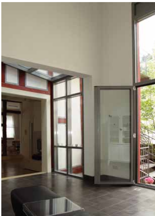
Picture 41 - Combination of old and new constructions in Bacharach (DE)

This good practice describes the preparation of a guide for the rehabilitation of the rural buildings in the Cinque Terre National Park. This form of heritage is one of the most threatened in the Cinque Terre National Park, due to various factors, i.e. the abandonment of agricultural activities, the transformation into second homes for leisure purposes and the loss of building skills. The park administration is pursuing a policy primarily aimed at safeguarding the terraced landscape, whose fragile balance has been compromised mainly by man's abandonment, and this project is part of the framework of the activities promoted by the park administration itself. The guide, based on preliminary research on the rural built heritage of the park, proposes technical solutions for appropriate repair and adaptation to modern needs. The guidelines were published at the end of 2006 and it is expected that they will become part of the park regulations. Coupled with the preparation of the guidelines, a pilot project for the integrated rehabilitation of a rural settlement in the mid-hills above Riomaggiore has been developed, aimed at testing the validity and applicability of the guidelines as well as at providing the park with accommodation facilities for the participants in the courses and workshops given by the University of Landscape and other related initiatives management by park administration.