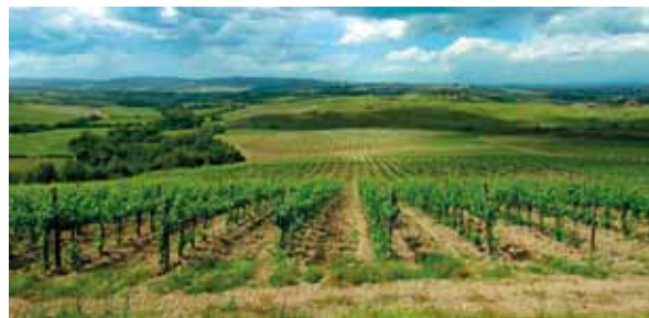
Picture 27 - Vineyards down on the hill of Montalcino