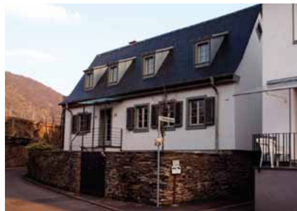
Picture 29 - Residential building of Family Müller in Oberwesel (DE) after renovation