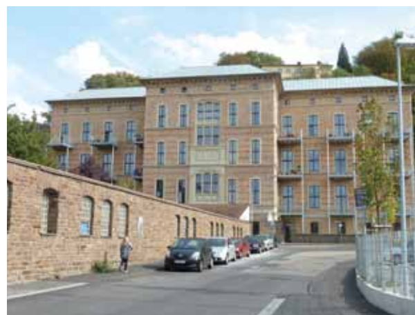
Picture 31 - Same building after conversion. Now 18 modern lofts offer modern living in old walls