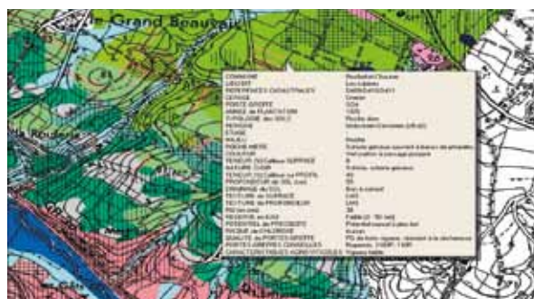
Picture 21B - Digital terroirs Atlas