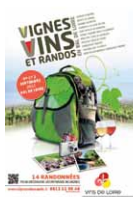
Picture 61 - As of 2005, the Interprofession des vins de Loire has been organising a weekend each year to explore vineyard landscapes. The routes are defined and coordinated by the vintners and welcome over 5,000 people, both inhabitants and visitors. Certain circuits are signposted and can be used all year round

We note a reinforcement of the mediation tools and the dedicated signposting strategies involving the inhabitants, who have become the ambassadors of their territory with respect to visitors. This local involvement plays a part in the renewal of the tourism offer: projects that link the exploration of the winegrowing heritage (vineyard landscapes, the constructed heritage, and know-how), the quality of accommodation and restaurants, and the networking efforts of professionals in tourism, winegrowing and the managers of cultural properties (châteaux, abbeys, museums, etc.).