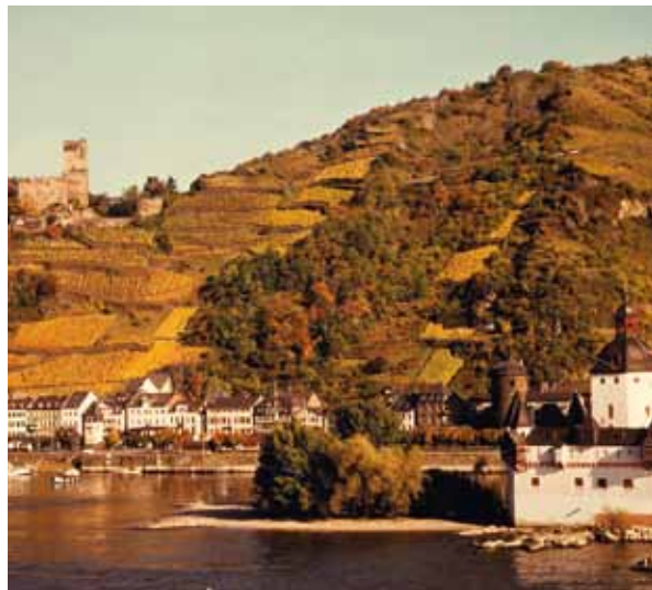
Picture 58 - A heritage landscape restoration project that is underway in the Upper Middle Rhine Valley