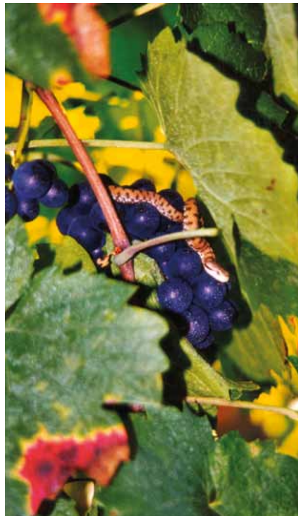
Picture 60 - The protection of biodiversity through the Vitiswiss and Vinatura certifications awarded in Lavaux (Switzerland)

We note major vineyard landscape restoration work (the restoration of the vineyard terraces in the Upper Middle Rhine Valley) and, more broadly, agricultural (the restoration of the alluvial fields and the development of cattle grazing in the Val de Loire and in Fertö-Neusiedlersee) or the establishment of diversified cultivation to maintain the landscape by reintroducing cherry cultivation (Upper Middle Rhine Valley, Fertö-Neusiedlersee) or aromatic herbs (Cinque Terre). These transformations are accompanied by agro-environmental measures to conserve, if not enrich, the biodiversity of these areas. These agricultural transformations often occur within the framework of a public land policy (observatory, pre-emptions, public landholding).