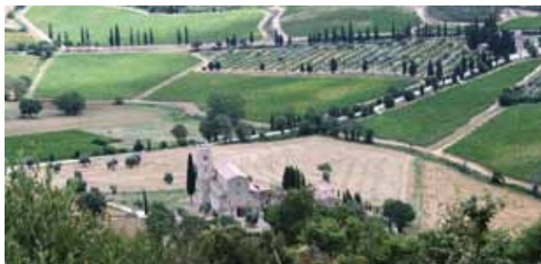
Picture 26 - Vineyards and olive groves around Sant'Antimo Abbey in val d'Orcia