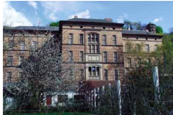
Picture 30 - Martin Gropius Building in Koblenz before conversion. Initially built as military hospital it closed down in 1988