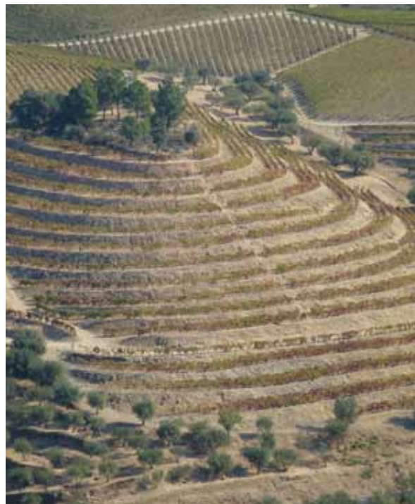
Picture 55 - Landscape architecture in the Alto Douro: optimising wine production

Finally, the major wine production regions (Val d’Orcia-Montalcino, Upper Douro, Tokaj, Val de Loire) do not have the same priorities as sites where wine production has a greater emblematic heritage value than a determinant economic value (Pico Island, Cinque Terre Park). In the first instance, landscape management will have to settle conflicts arising from the profitability of the winegrowing sector versus the requirements of heritage landscape conservation, whereas the key issue for the other sites will be to search for alternative agricultural resources to counter the abandonment of land use and of vineyards.