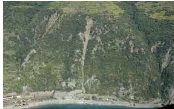
Picture 24 - Abandonment and resulting landslides are mainly located in the less accessible areas (IT)

Also, in recent years, a new type of awareness has emerged, according to new requests from the market and opportunities for public funding. Agriculture is becoming