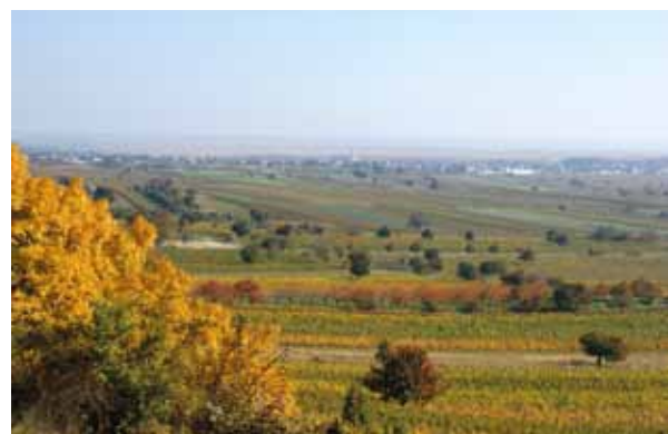
Picture 51 - Fertö – neusiedler See (AT) inscribed in 2001